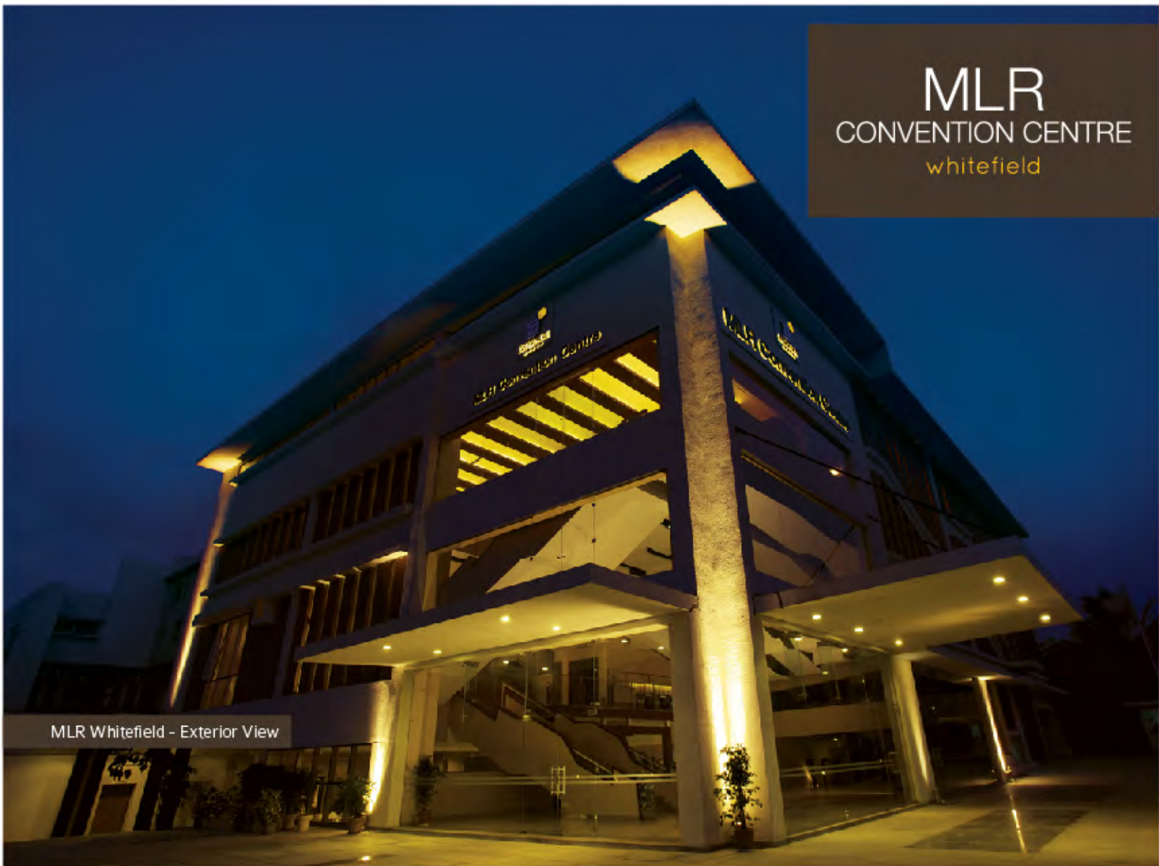
MLR Whitefield - Exterior View