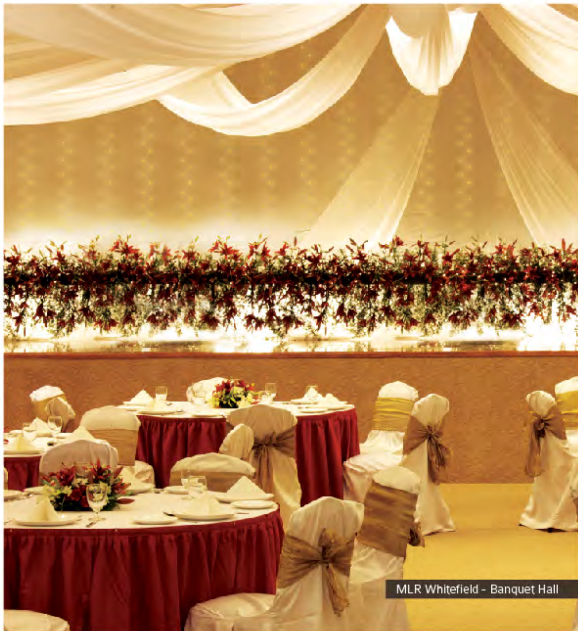
MLR Whitefield - Banquet Hall